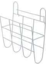
File holder & side rail 571 x 397 x 150mm Code: FHS531