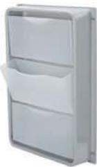
Foldaway side drawer unit ABS 3 side files (open or closed) Code: FAS416