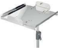
Stainless steel defibrillator shelf (extra strength) 330 - 410 x 330mm Code: DSS433