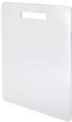
CPR cardiac board & hooks 440 x 510 x 10mm Code: CBH451