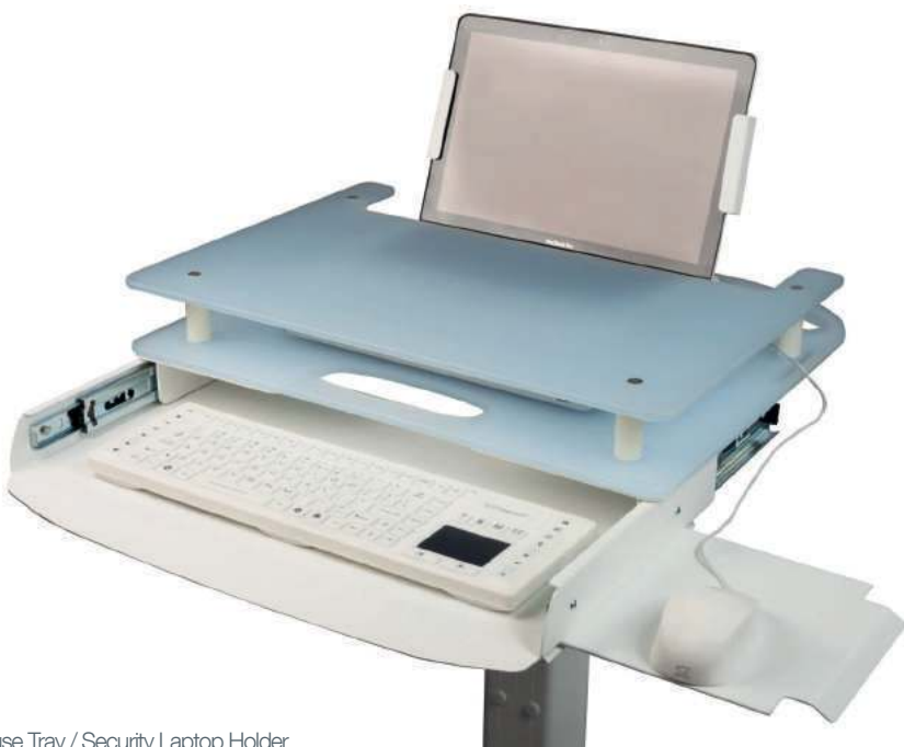
Retractable Keyboard and Mouse Tray / Security Laptop Holder