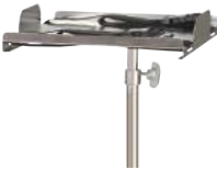
Defibrillator shelf 355 x 355 - 415mm Code: DSA344