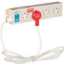
4 socket electrical board with lead (non-removable) Code: OPL100