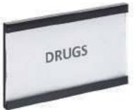
Magnetic label holders 80 x 50 x T5mm 6pcs/pack Code: MLH855