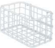
Sharps bin holder & side rail 100 x 190 x 110mm Code: SBH200