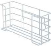
Glove dispenser side rail 160 x 260 x 95mm Code: GDB119