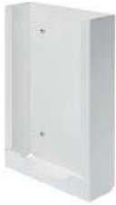
3 box glove holder & side rail 400 x 260 x 85 xmm Code: GDS428