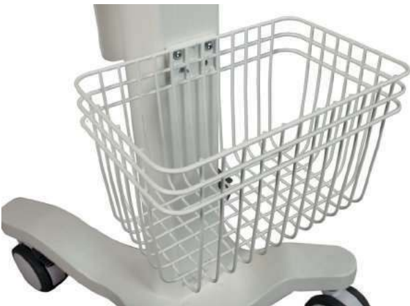
Small Wire Basket