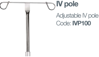
IV pole Adjustable IV pole Code: IVP100