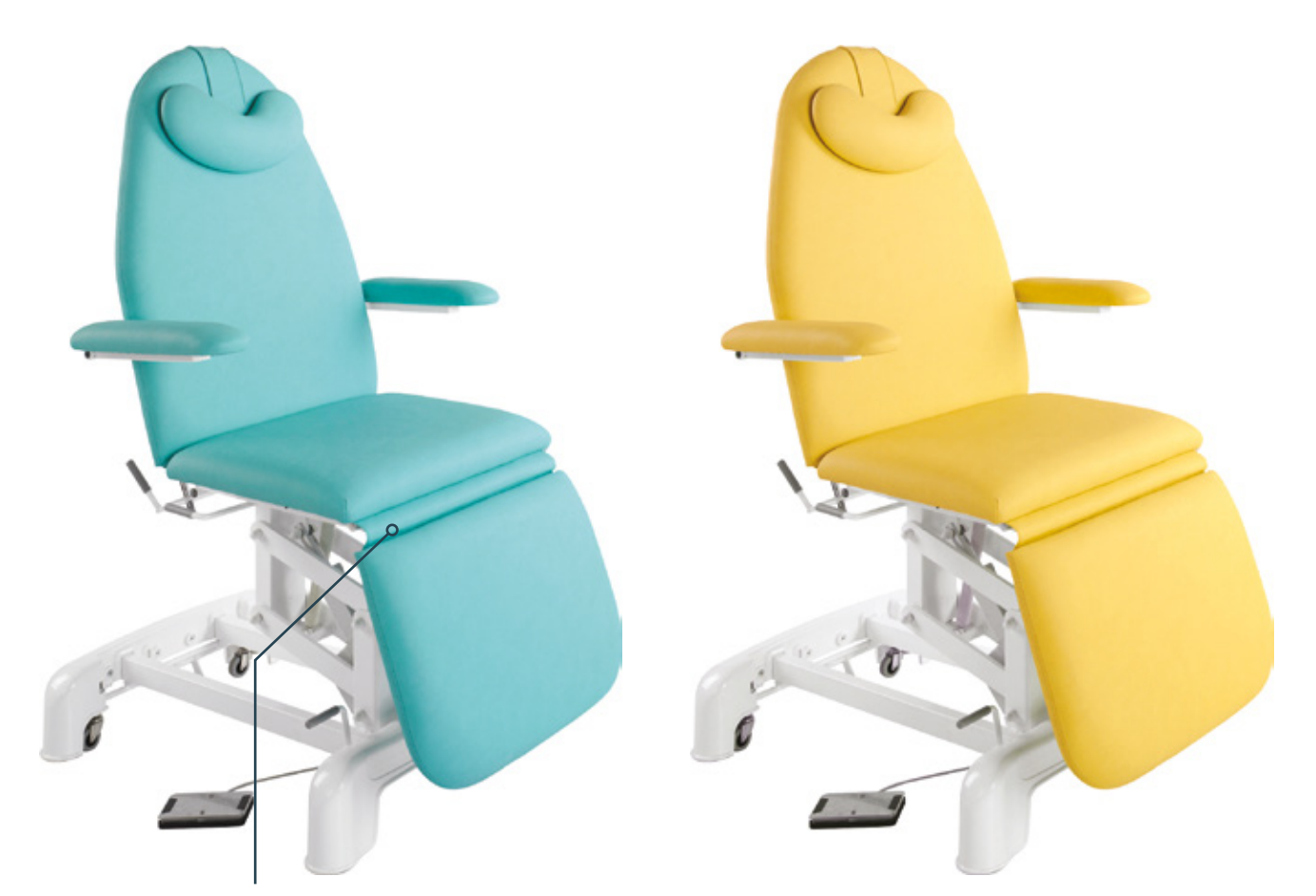
Provides precise patient positioning with raised seat tilt facility.

Choose from electronic height operation with foot console or hydraulic height operation with pneumatic foot pump to achieve optimal patient positioning. The long backrest is ideal for ultrasound examinations, while the compact base allows close access to the patient. The steel frame and vinyl upholstery both benefit from an anti-microbial protective coating for maximum hygiene.