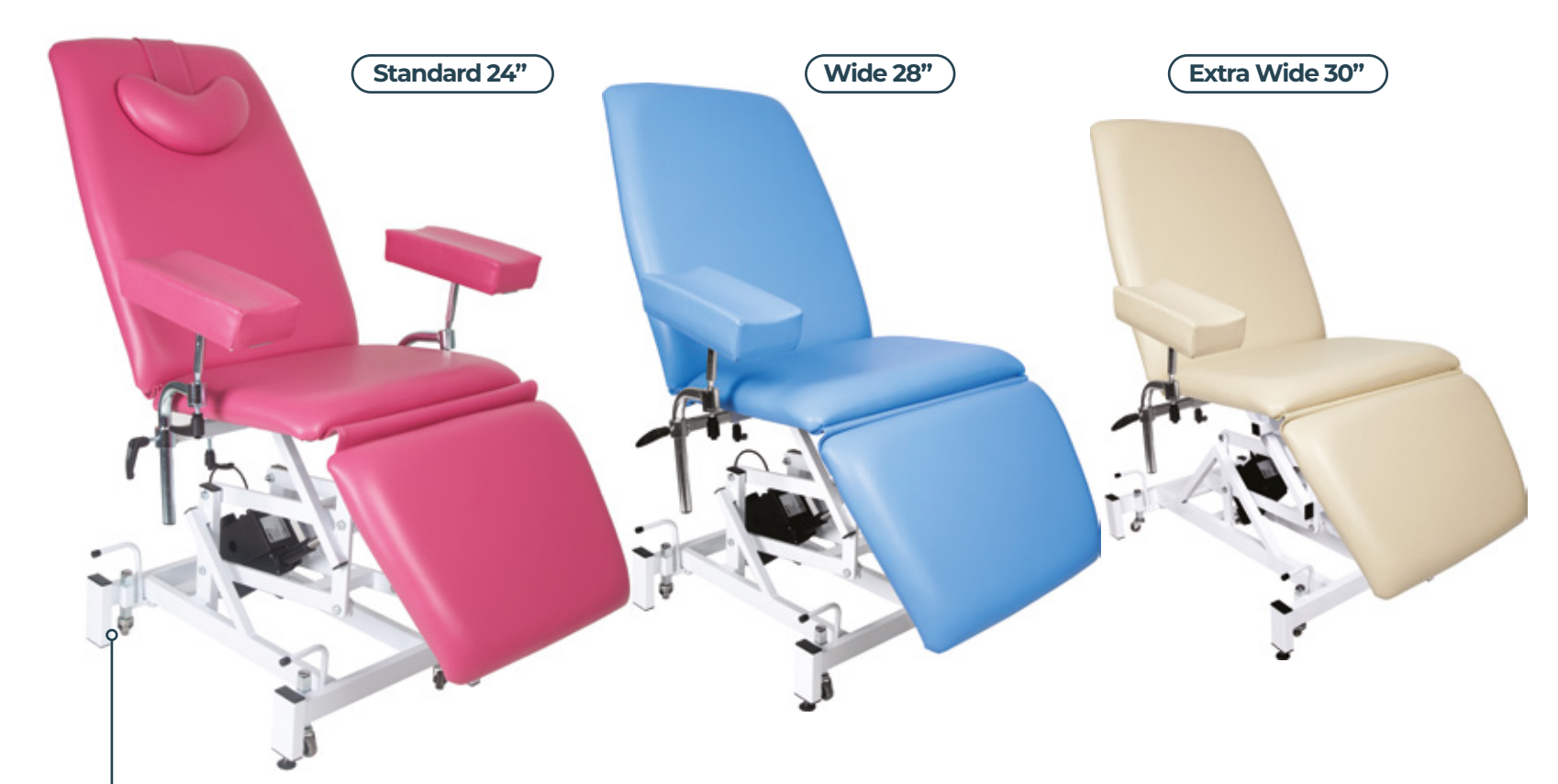
Retractable wheel base allows chair to be moved and positioned with ease