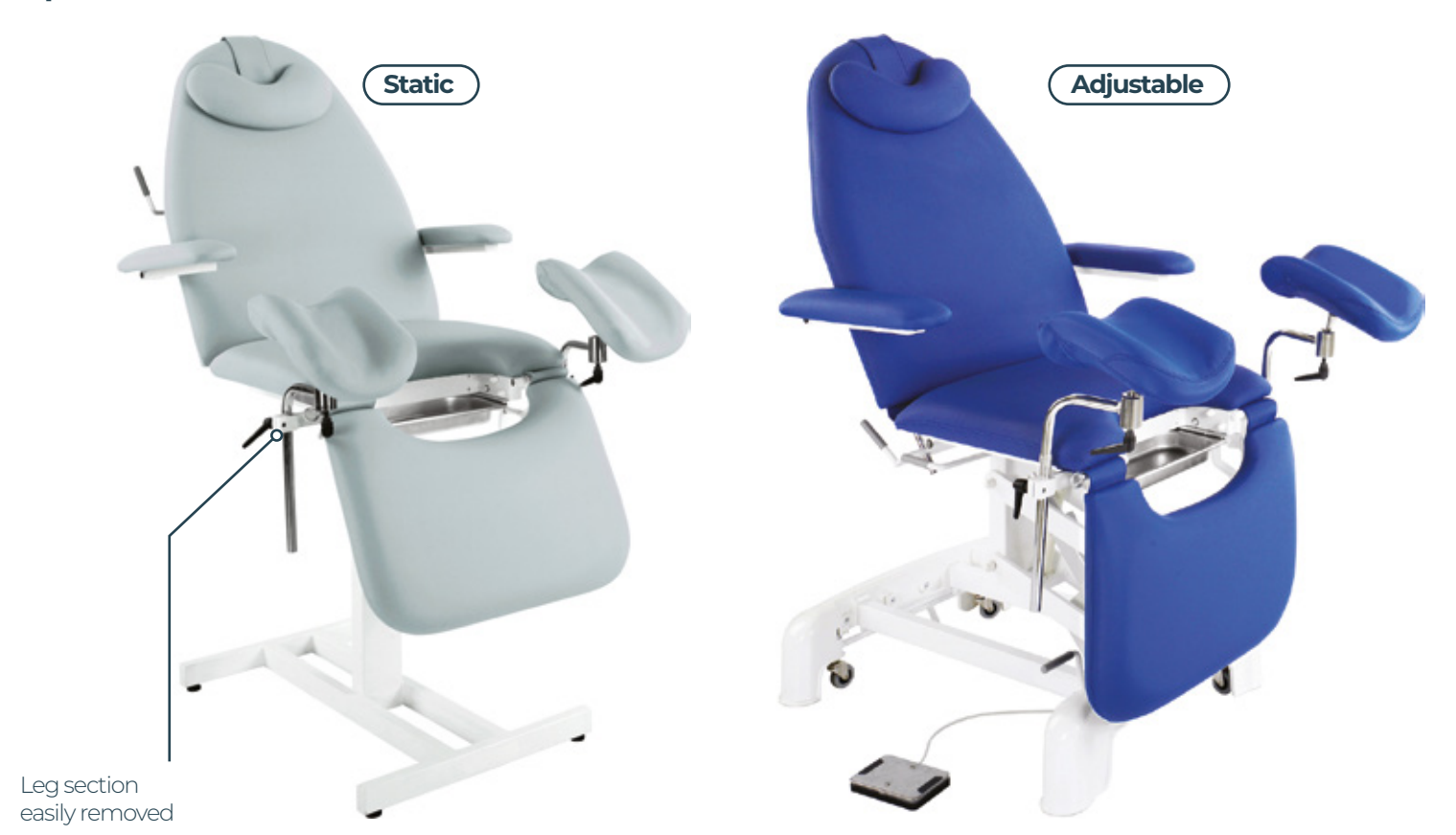
Options to order: