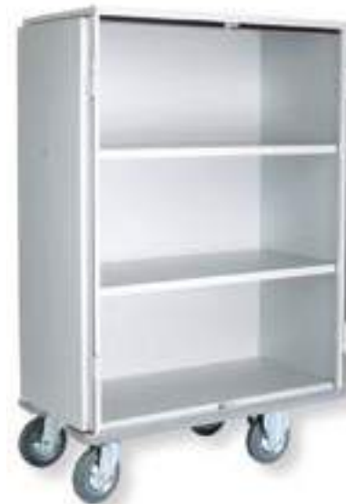
Large - 883ltr