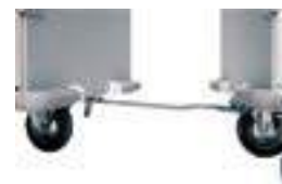
Hinged tow bar with spring and peg