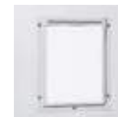
A4 document holder