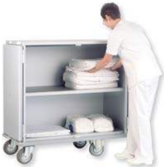
Small - 572ltr