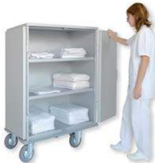
Medium - 731ltr