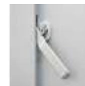
Lock with two keys