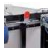
Central brake system