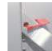
Tamper evident seal