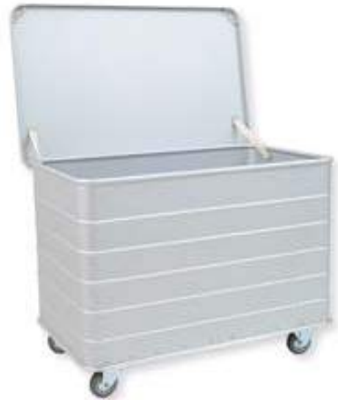
Small - 366ltr