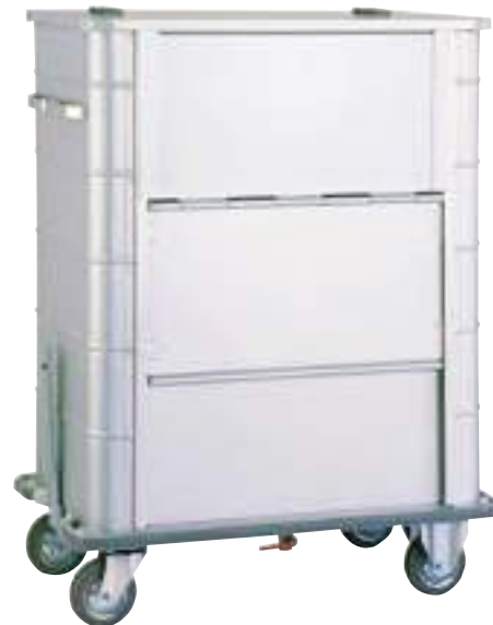
Medium - 699ltr