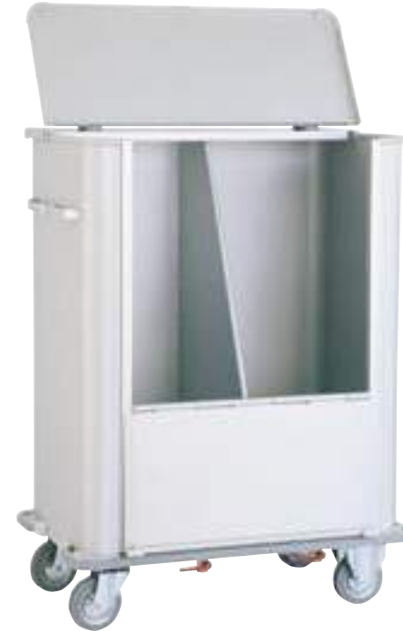
Medium (2 compartments) - 714ltr