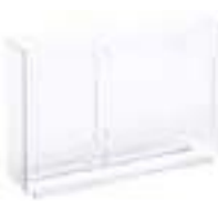
3 box glove holder (polycarbonate) Horizontal storage. 260H, 395W, 105D (mm) With trolley mounting rail Code: GH2312S For wall mounting Code: GH2310W