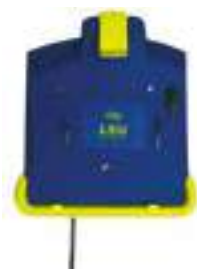
Laerdal suction unit mount with AC power Code: 782630