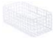
Sharps bin holder