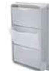
Foldaway side drawer unit

ABS 3 side files (open or closed) Code: FAS416