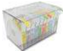
Anaesthesia label dispenser

Clear plastic anaesthesia label dispenser. Dimensions: 300 x 127 x 140mm Code: AMDSP-HC10