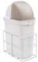
Waste container w/lid

Clear plastic anaesthesia label dispenser. Dimensions: 300 x 127 x 140mm Code: AMDSP-HC10