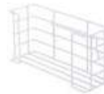
1 box glove holder 160 x 260 x 95mm Code: GDS119