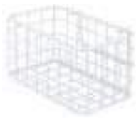
Sharps bin holder