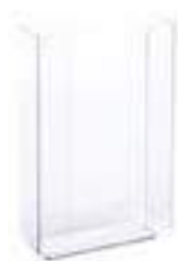
3 box glove holder (polycarbonate) Vertical storage. 400H, 258W, 105D (mm) With trolley mounting rail Code: GH4212S For wall mounting Code: GH4210W