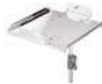
Stainless steel defibrillator shelf 330 - 410 x 330mm Code: DSS433