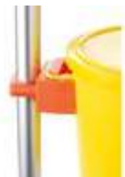
Daniels POUDES® sharps bin bracket (Up to 7L) Code: DD501