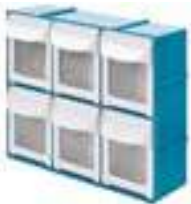
Tilt bin organiser (half size)

Suitable for narrow trolleys. Dimensions: 300 x 111 x 230mm Code: TBS312