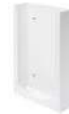
3 box glove holder 400 x 260 x 85 xmm Code: GDS428