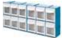
Tilt bin organiser (small)

Suitable for narrow trolleys. Dimensions: 300 x 111 x 230mm Code: TBS312