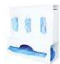
ABS triple glove box and large apron dispenser 400 x 395 x 135mm (HWD) Code: GAD3-BIO