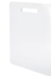
CPR cardiac board & hooks

ABS 3 side files (open or closed) Code: FAS416